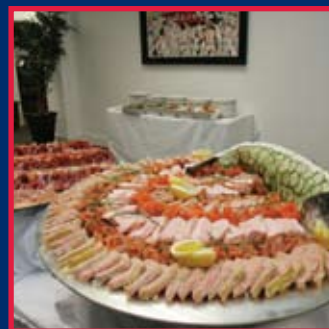
Hot & Cold Buffet