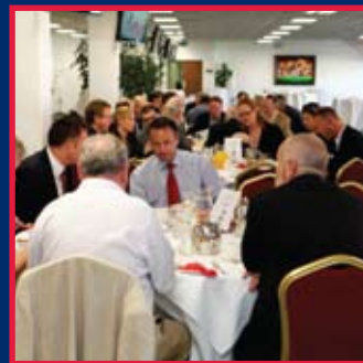
Pre Match Reception